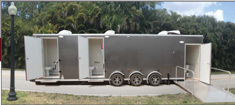
This ADA trailer features a hydraulic lift system to easily lower the unit to the ground

Whatever Your Event PORTABLE RESTROOM TRAILERS, LLC portablerestroomtrailers.com We Have The Right Solution