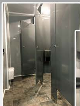
shown with optional full heat

The spacious floor plan includes 1 women's central suite with 3 stalls and 1 men's central suite with 1 stall and 2 urinals, each with a separate entrance.